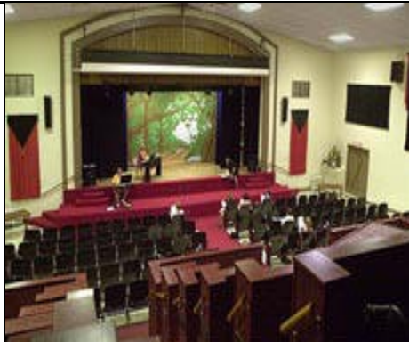
The historic Grand Theatre was named one of Pittsburgh's Top Ten Preservation Opportunities in 2011 by the Young Preservationists Association.

March 16, 17, 23, 24 at 7:30pm March 18 & 25 at 2pm, 2012